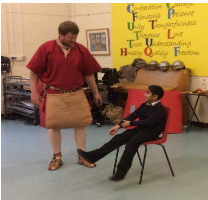
The Roman soldier visiting 4KW