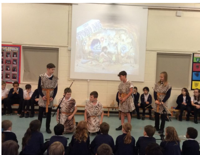
6GB Class Assembly

4KW also performed an assembly. They shared lots of interesting facts about the Ancient Romans. They even mentioned that Roman adults (like adults now) liked an occasional glass of wine!