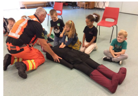
The Air Ambulance visit to 2HF

Year 2 had a visit from the air ambulance crew and some paramedics too. This was to help them learn about the emergency services. The children were taught some vital life-saving skills.