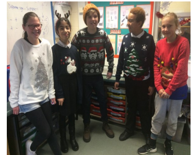
Christmas Jumper Day