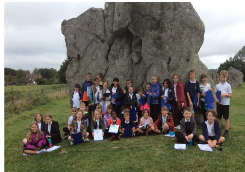
5TM visit to Avebury

In Term 1, both Year 5 and 6 went to Avebury to help them learn about the Stone Age. The Avebury Stone Circle is over 4200 years old! The children explored the ancient stones and also a massive 'Wish Tree' that was nearby.